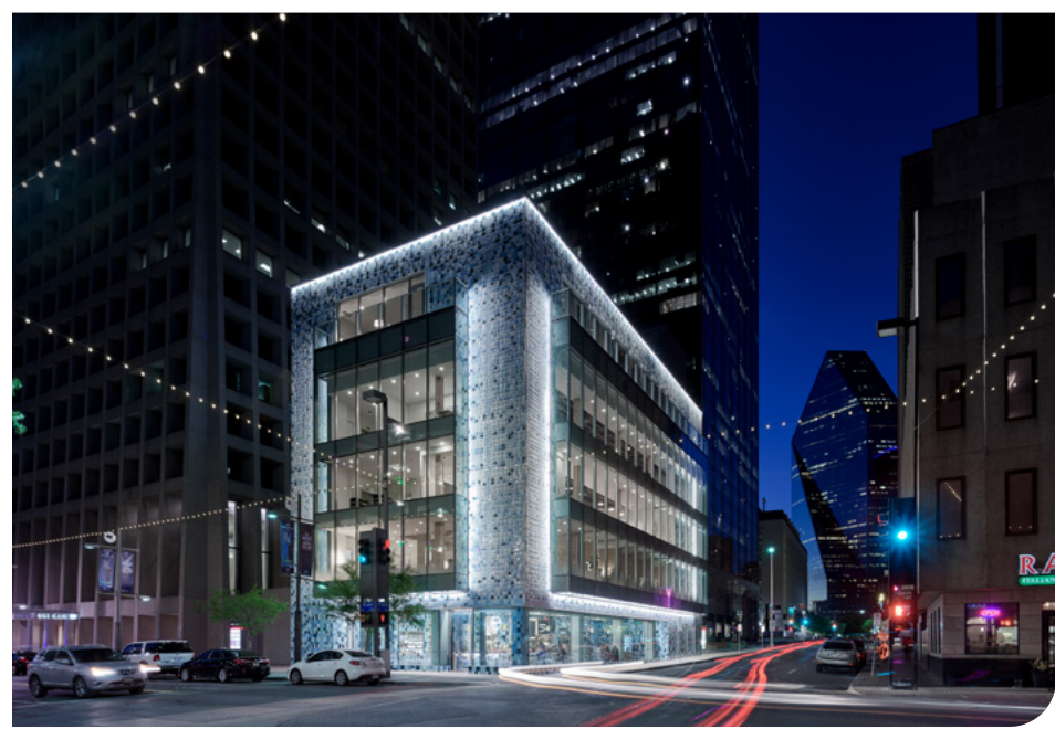
Solarban® 90 Starphire® glass from Vitro Architectural glass enhances the handmade glazed ceramic tile façade at 1217 Main Street in downtown Dallas.